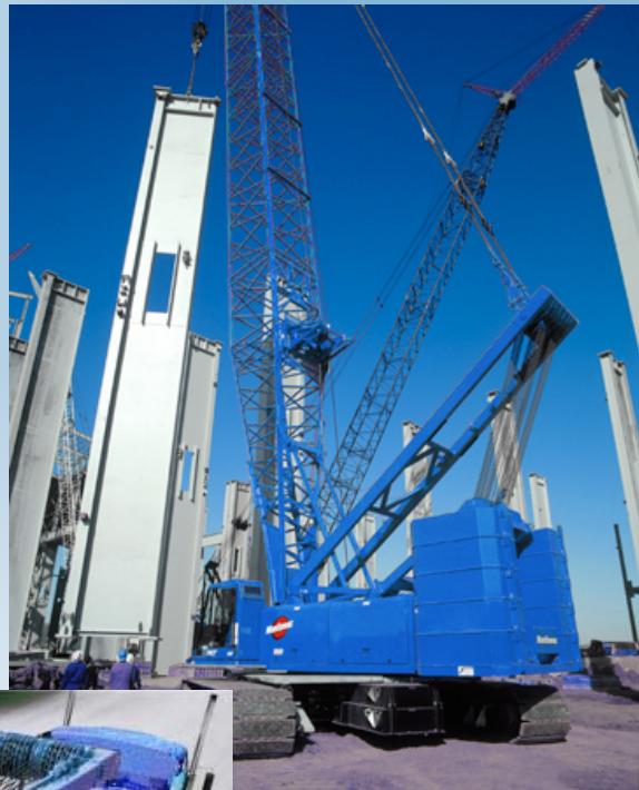
Above: A M999 placing columns into place and side walls of a new factory

The M999 can completely assemble and disassemble itself reducing costs in isolated areas.