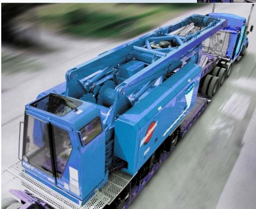
Left: The M999 upper works and carbody on a single truck load for efficient transport.