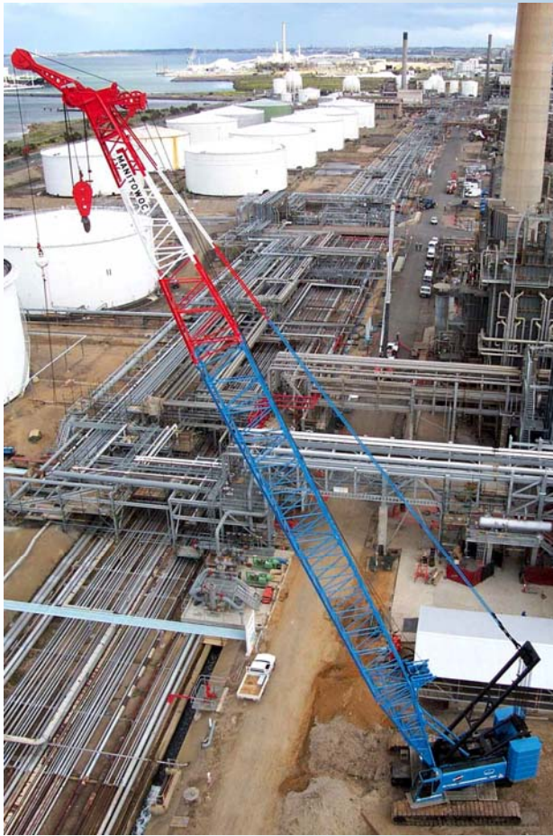
Above: A M999 working at a refinery in Victoria, Australia.

The M999 Series 3 has a capacity of 250 Te at 4.6m and 111.5 Te at 10m radius.