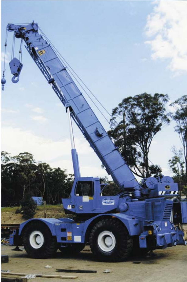
Left & Below: 55 Te rough terrain crane undergoing pre-shipment inspections at Lampson's Toronto facility, Australia.