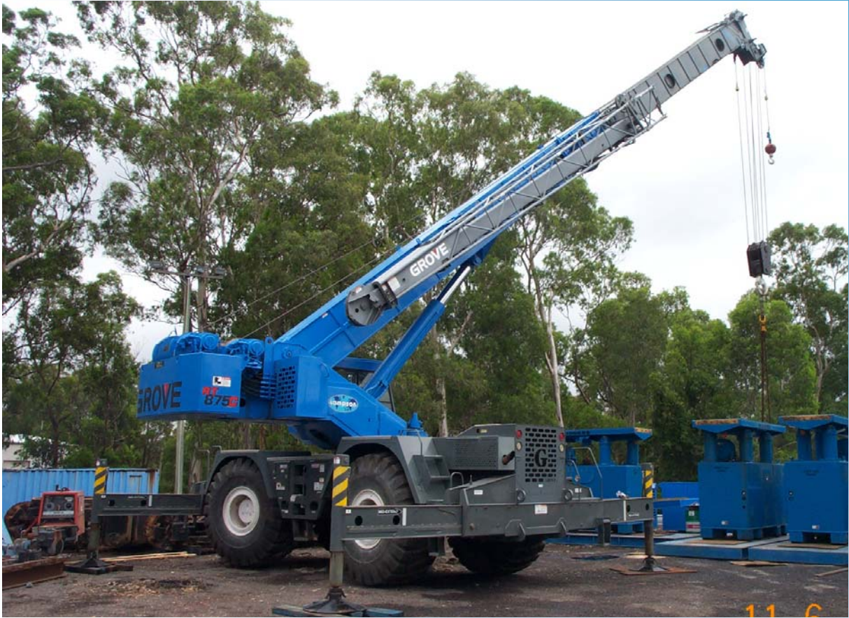
Above and Right: The Grove RT 875C is at work in the yard (Toronto, Australia) moving equipment out to be used on a mine site.